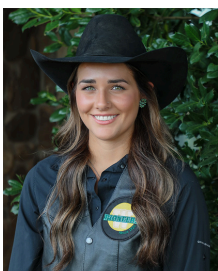
Aspyn Bass Nursing Club