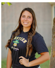
Taytum McIntosh Baptist Collegiate Ministries