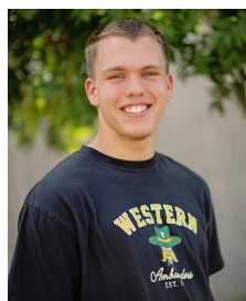
Blaine Shelburne Baptist Collegiate Ministries